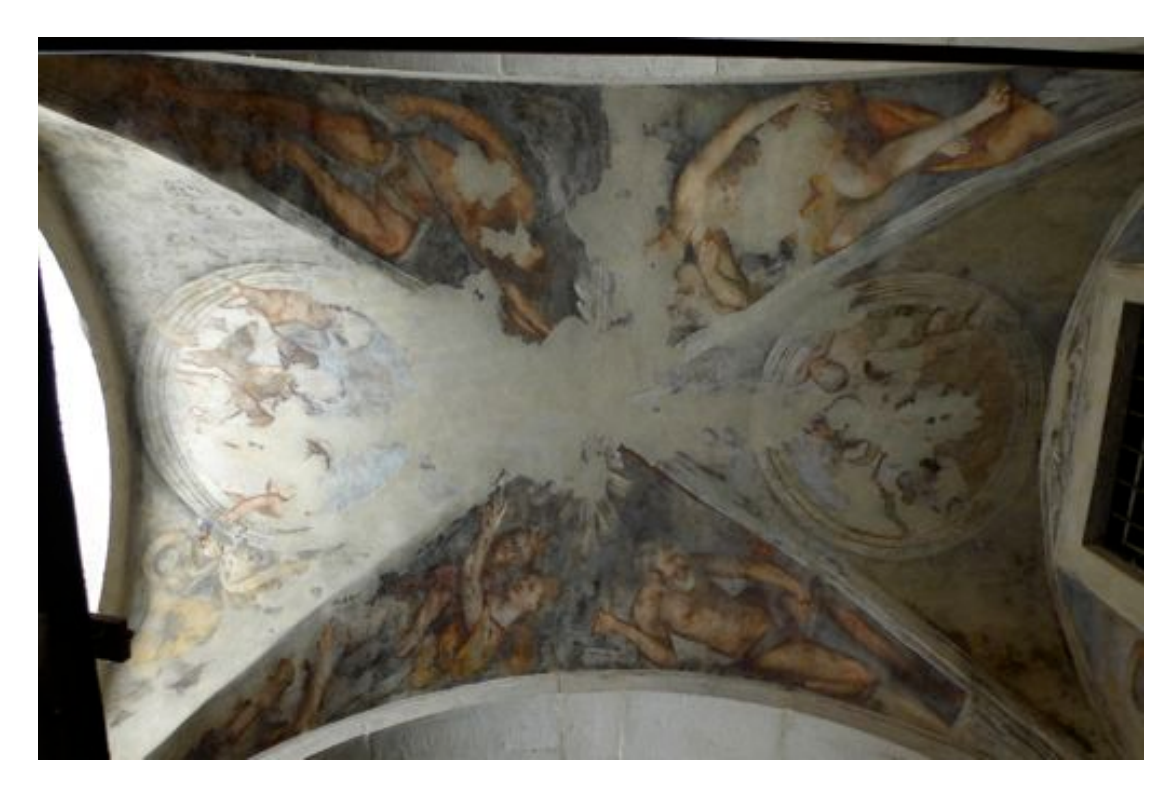
Fig. 8 Drapperia frescoes, after 1519; detail of vault with mythological figures: Vulcan, Apollo, Neptune, Venus with a lover (?). Fresco. Ruga degli Orefici, Venice.