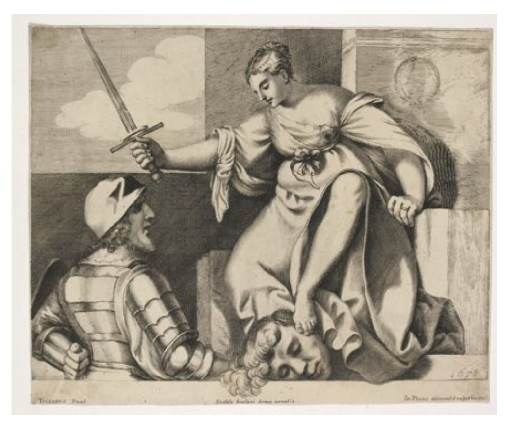
Fig. 6 Giacomo Piccini, Justice or Judith; female figure seated brandishing a sword and trampling on a man's head; with a solder to left, half-length and looking up towards rightwith sword in hand (1508-09); copy after fresco by Titian on the Fondaco de' Tedeschi, 1658. Etching, 23.1 x 28.3 cm. British Museum.