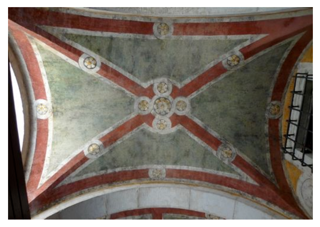
Fig. 7 Drapperia frescoes, after 1519; detail of vault with bordered vaulting. Fresco. Ruga degli Orefici, Venice.