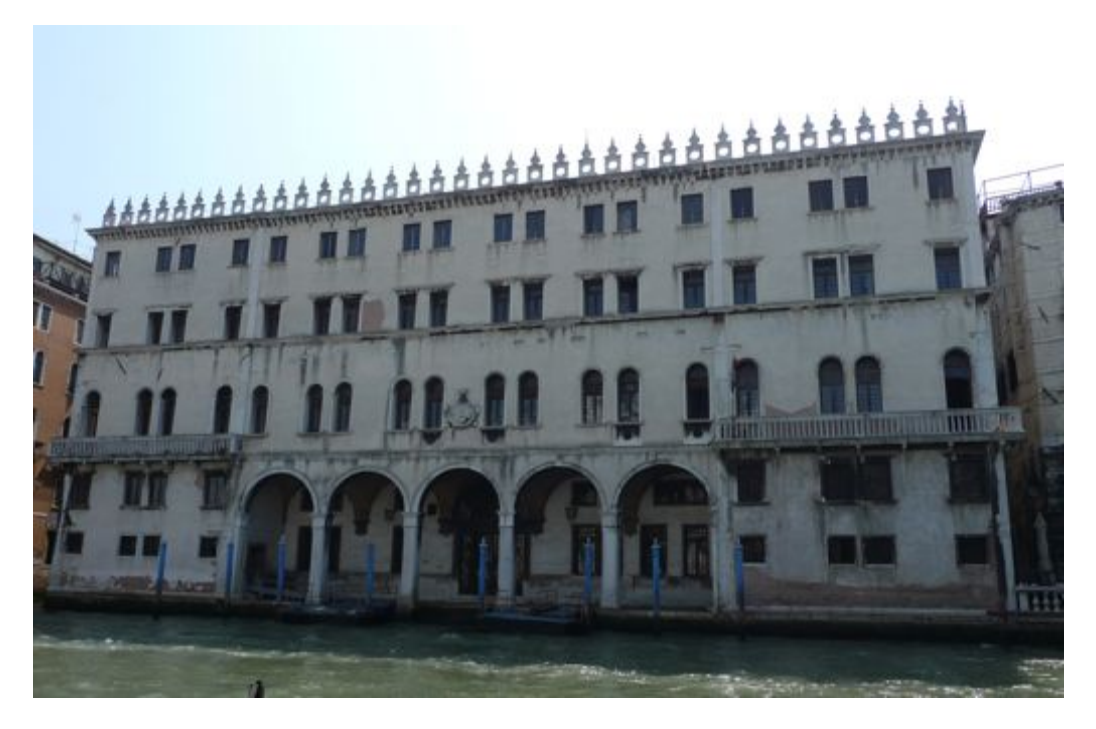
Fig. 5 Fondaco dei Tedeschi (1505-8), Canal Facade.