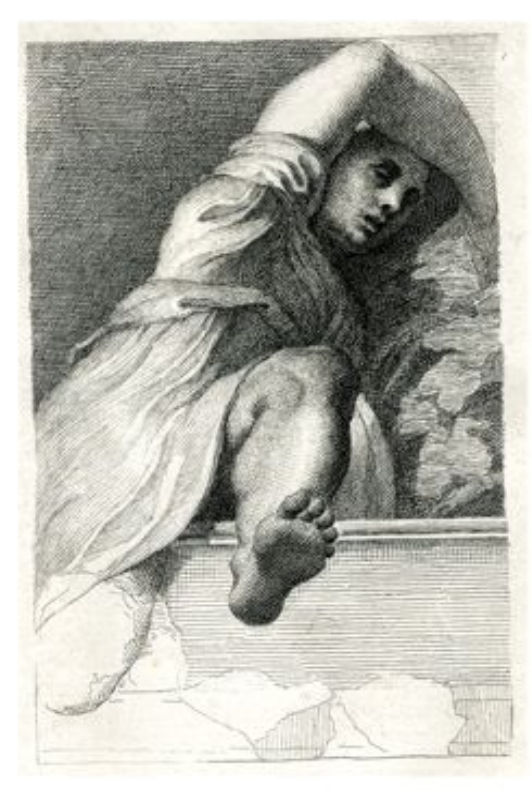
Fig. 11 Antonio Maria Zanetti, A young boy falling backwards over a parapet (1541) , copy after fresco by Tintoretto on Ca' Soranzo dell'Angelo, 1760. Etching, 17 x 11.5 cm. British Museum.