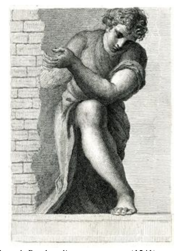
Fig. 10 Antonio Maria Zanetti, Boy kneeling on a parapet (1541) ; copy after fresco by Tintoretto on Ca' Soranzo dell'Angelo, 1760. Etching, 16.8 x 11.8 cm. British Museum.