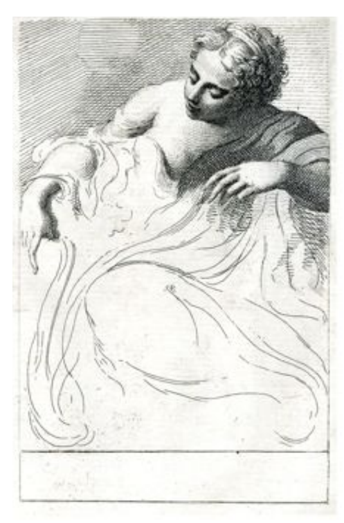
Fig. 13 Antonio Maria Zanetti, A seated woman (1541) , copy after fresco by Tintoretto on Ca' Soranzo dell'Angelo, 1760. Etching, 16 x 10.4 cm. British Museum.