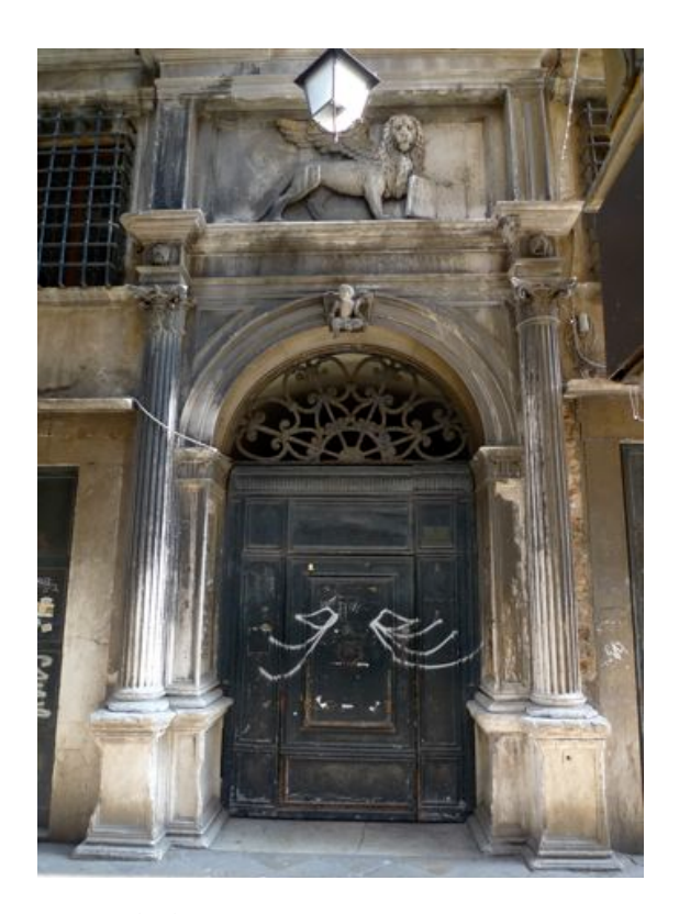
Fig. 4 Fondaco dei Tedeschi (1505-8), Calle del Fontego entrance doorway.