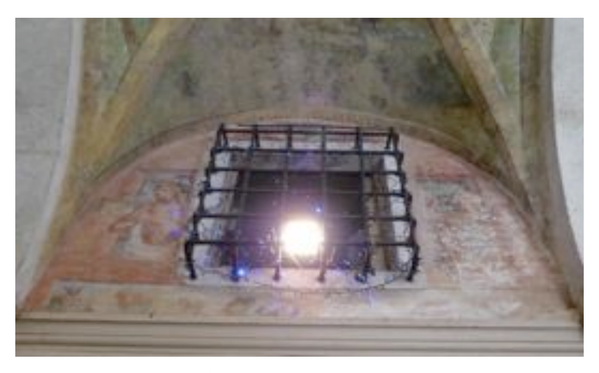
Fig. 9 Drapperia frescoes, after 1519; detail of lunette with a young boy and a young girl in fictive windows. Fresco. Ruga degli Orefici, Venice.