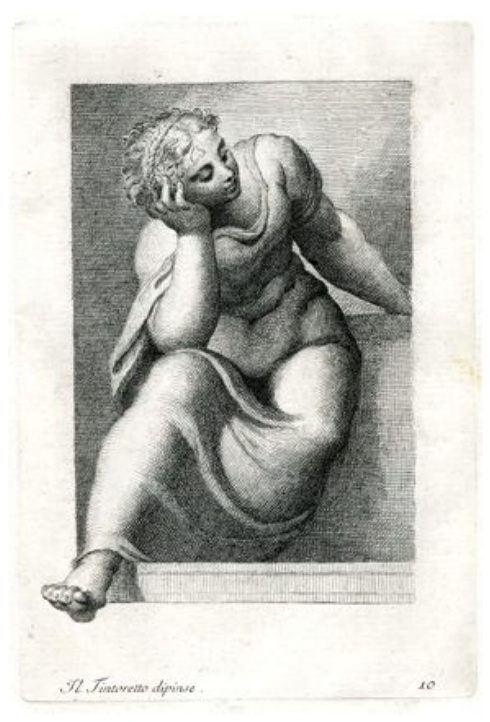
Fig. 12 Antonio Maria Zanetti, Woman resting her head on her right hand (1541) , copy after fresco by Tintoretto on Ca' Soranzo dell'Angelo, 1760. Etching, 17 x 11.5 cm. British Museum.