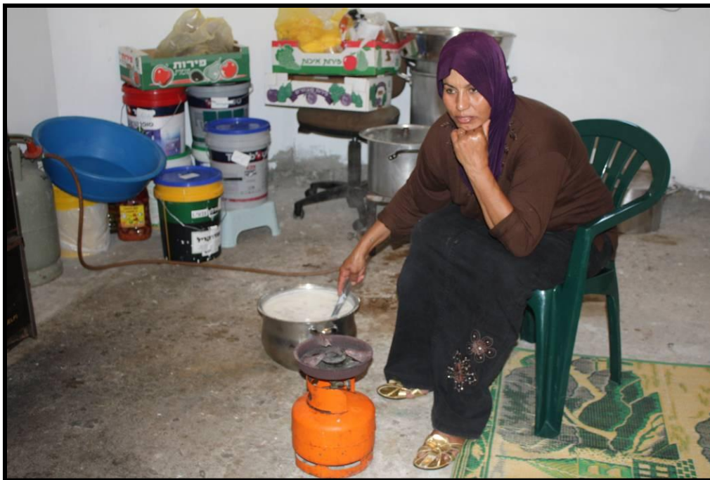
Figure 25: Neighbour preparing lunch for wedding guests.