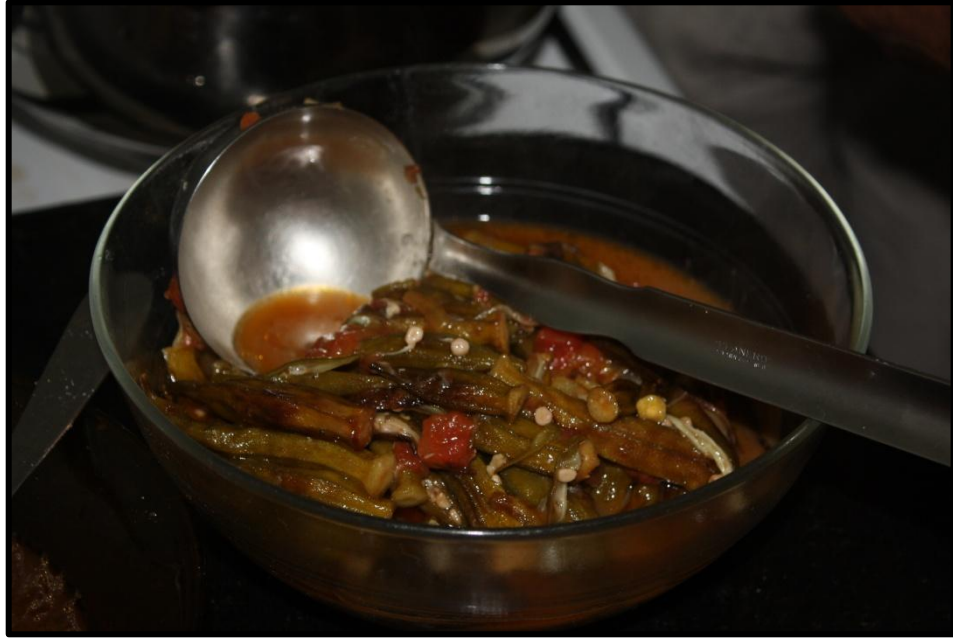
Figure 15: Khazneh's Bami in tomato and garlic sauce.