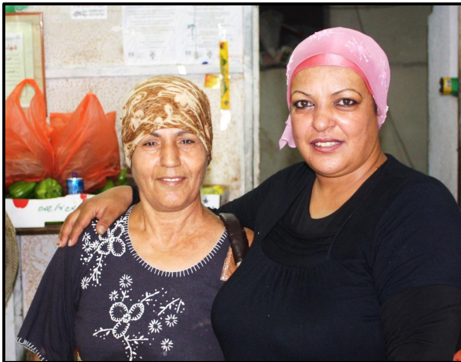
Figure 4: Khazneh and her best friend.