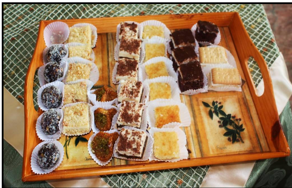
Figure 29: Cakes made by Samira using recipes from a book.