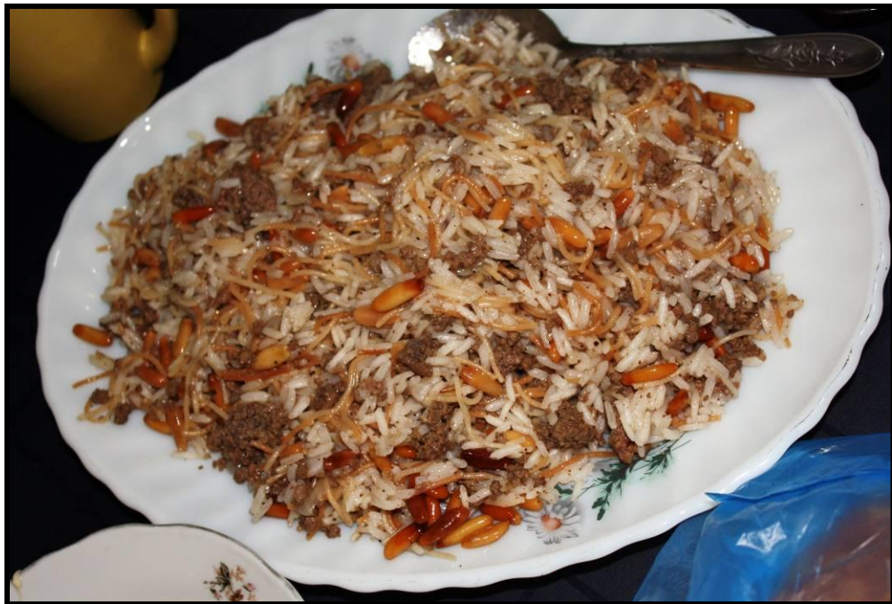
Figure 27: Almira's rice with noodles, meat, and pine nuts.