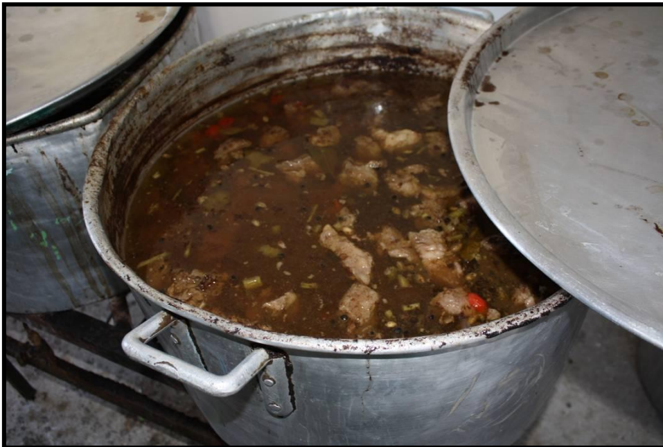
Figure 39: Lahkme , meat stew, cooked for wedding feast in Tamra.