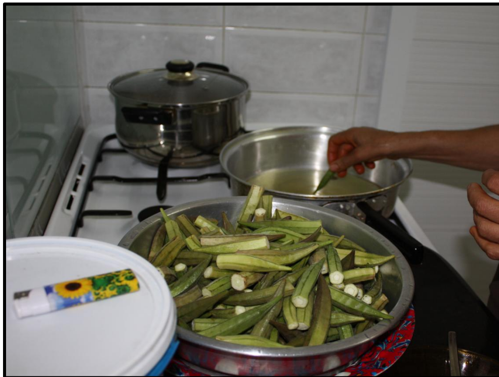
Figure 14: Deep frying bami , 'okra,' at Khazneh's house in Haifa.