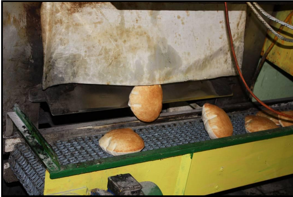
Figure 22: Pita at the bakery in Tamra.