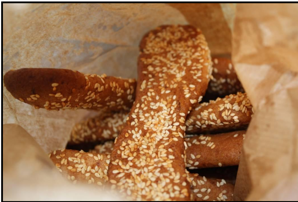
Figure 23: Specialty bread at the bakery in Tamra.