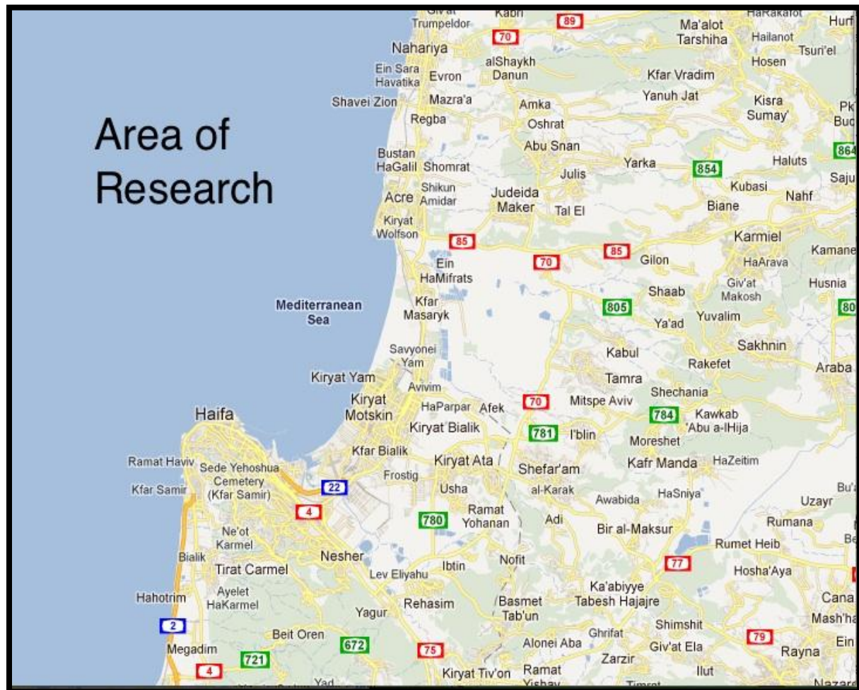
Figure 2: Map of the research area in Israel.

With Your Mouth Full, considers how food works as a language in any society, expressed in metaphors and symbols that are particular to each culture and how Mawasi Bedouin use food in this manner. Chapter ten, Find Your Napkin, Loosen Your Belt, is the conclusion, where I sum up the data and analysis presented, leading on to the coffee and dessert of the end notes and bibliography. Let us begin.