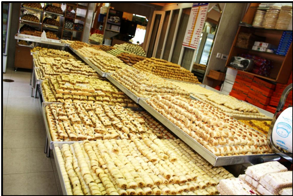
Figure 10: Arab cake and pastry store.