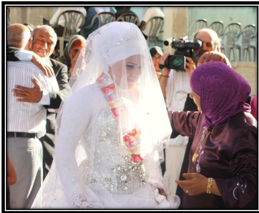
Figure 41: Bride is welcomed by her mother-in-law.

bride from her house. Because this was a traditional parallel first cousin marriage, her house was next door to his and the women joked about not having to go too far to get her. As they entered the bride's house, she was seated surrounded by her family, men and women, with her father and uncles beside her, dressed in an elaborate gown with a beautifully constructed hijab and a long necklace made from $200 NIS notes (see figure 43). She was escorted from her home by her father and uncles, all with sombre expressions, to the groom's house, with her little brother,