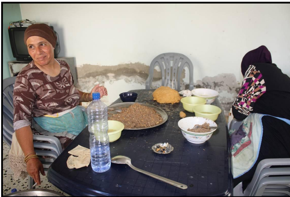
Figure 31: Women preparing kube , ground beef mixed with bulghur wheat and spices, for the wedding.