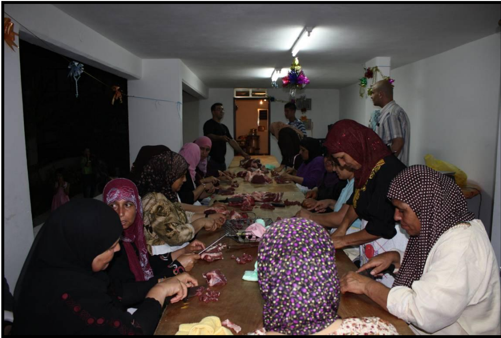
Figure 34: Women's meat cutting ceremony for the wedding in Tamra.