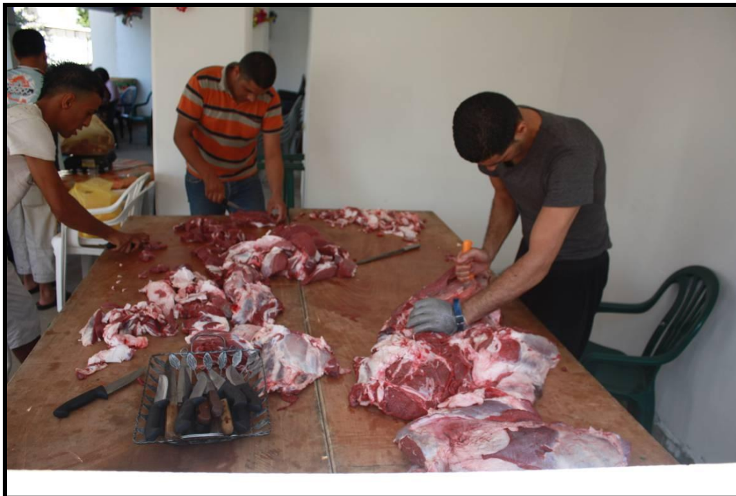
Figure 35: Men cutting large pieces of meat off the bones for the wedding feast.