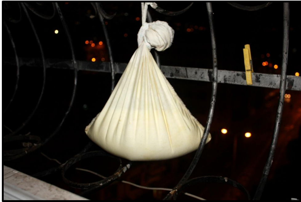
Figure 11: Making lebneh , yogurt cheese, at Khazneh's house in Haifa.