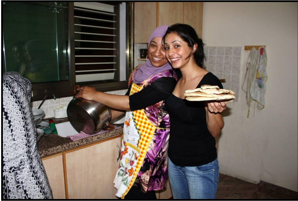
Figure 24: Cousins in the upstairs kitchen at Almira's house in Tamra.