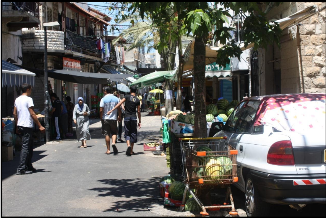
Figure 3: Road leading to the market in Haifa.