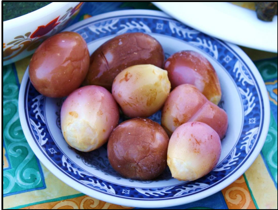
Figure 13: Khazneh's pickled betinjan , 'eggplant with hot peppers.'