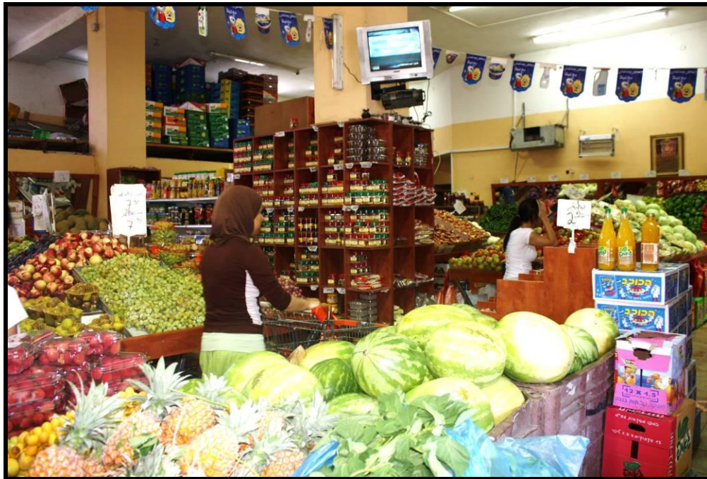
Figure 20: Supermarket in Tamra.