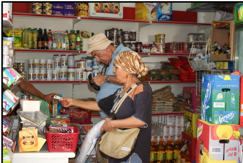
Figure 6: Khazneh at the sundries store in the market.