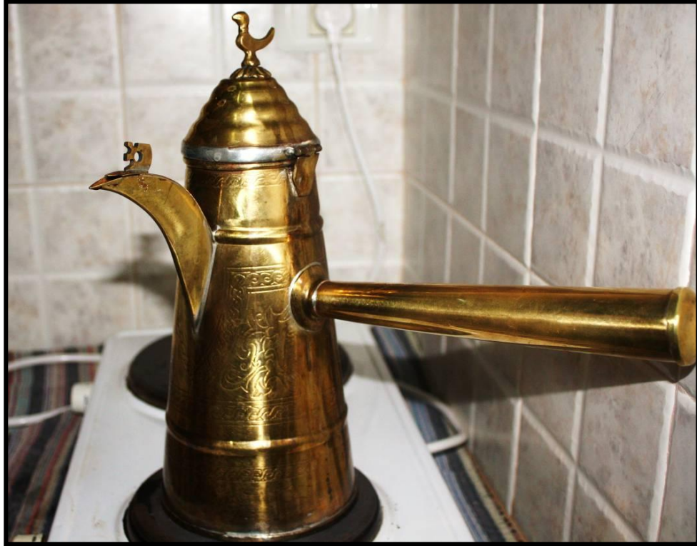
Figure 32: Traditional coffee pot warming on a non-traditional hot plate.