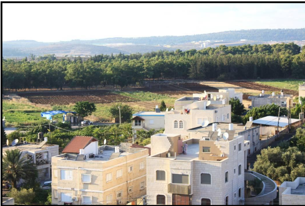
Figure 19: View from the roof of agricultural fields in the village in Tamra.

and Fatimah was cooked by a man who is locally famous for cooking for weddings. When I asked to observe for my fieldwork, he said, “No one will watch me cooking. No man or woman.” Cooking for weddings is competitive and many of the cooks guard their secrets from the eyes of others in the hopes of maintaining an advantage with their unique recipes, hence the photos presented here of the wedding feast are of the food after it was finished cooking.