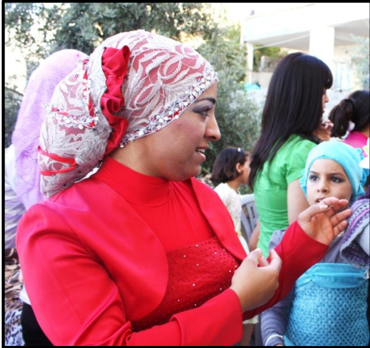
Figure 41: Young Bedouin woman wearing an elaborate hijab for the wedding in Tamra.

For special events, dresses, hair, and makeup occupy as much attention with Bedouin women as they do women in the West. Younger women who wear the hijab often pay to have an elaborately decorative hijab created for them to match their dress and to have their makeup done professionally (see Figures 41 and 42).