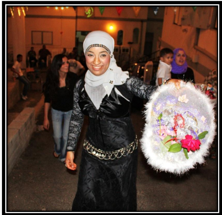
Figure 42: Young Bedouin woman wearing a stylishly folded hijab.

folding and sometimes profited from her talents when women came to her for weddings or other special events. Her cousin wanted to take the same course to make some extra money in Haifa. For the wedding I attended, the groom's family had paid 8,000 NIS (CAD 3,000) for two dresses for the bride (her bride's party and wedding party dresses) and two sessions of