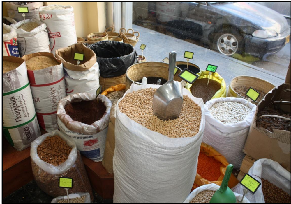
Figure 9: Dry foods store in the market.