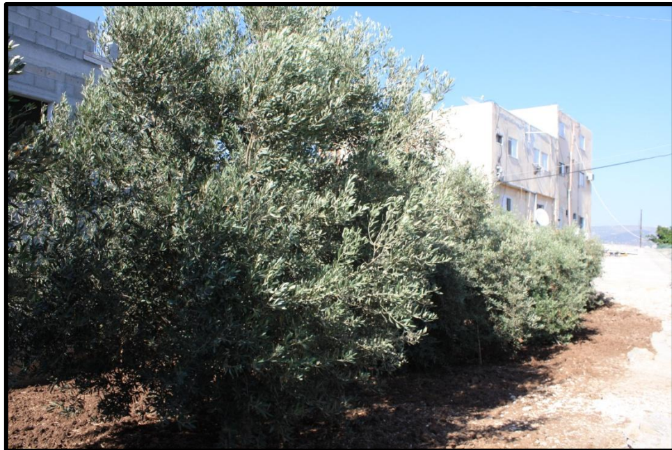
Figure 16: Olive trees in Khazneh's garden in I'blin.