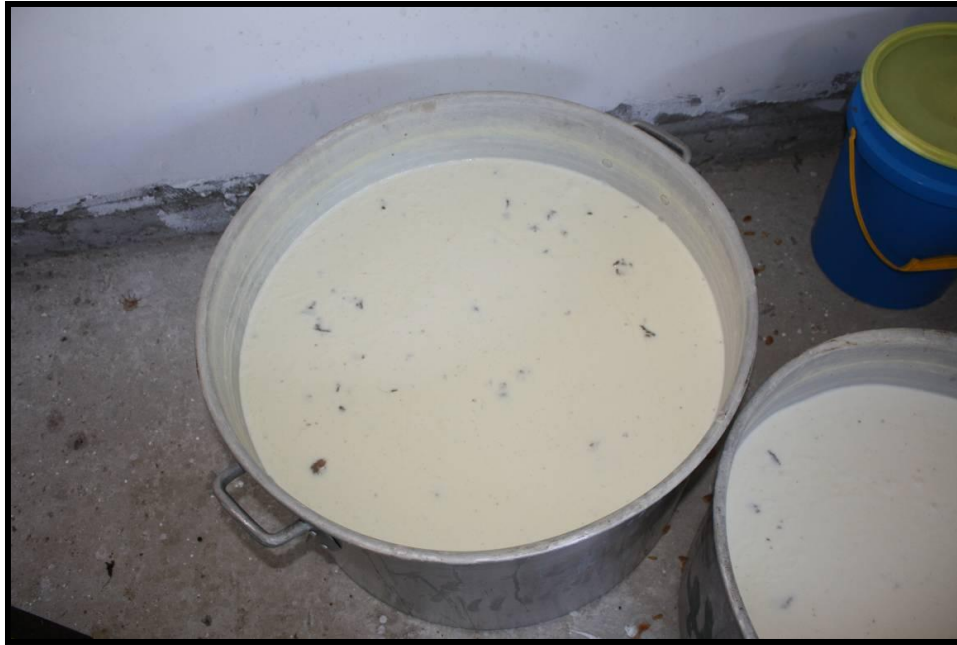
Figure 38: Meat cooked in yogurt for wedding feast.