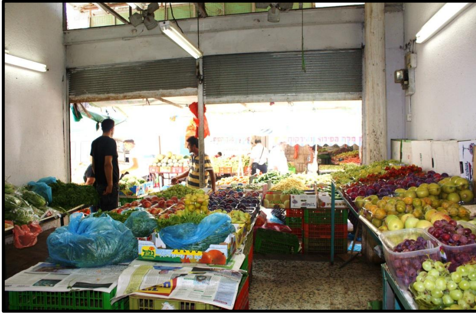
Figure 7: A friend's store at the market.