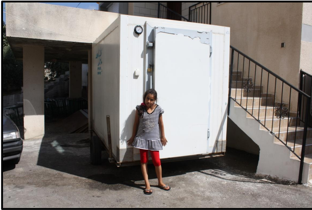
Figure 36: Young girl in front of refrigerator trailer for food at the wedding in Tamra.