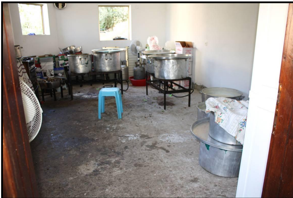
Figure 37: Wedding food cooked by secretive chef for the wedding in Tamra.