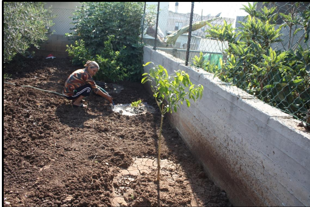
Figure 18: Khazneh watering her new grape vines and citrus trees.