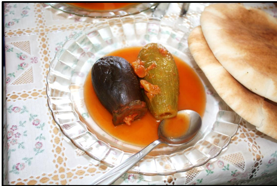
Figure 12: Khazneh's Mahashee , 'stuffed eggplant and squash'.