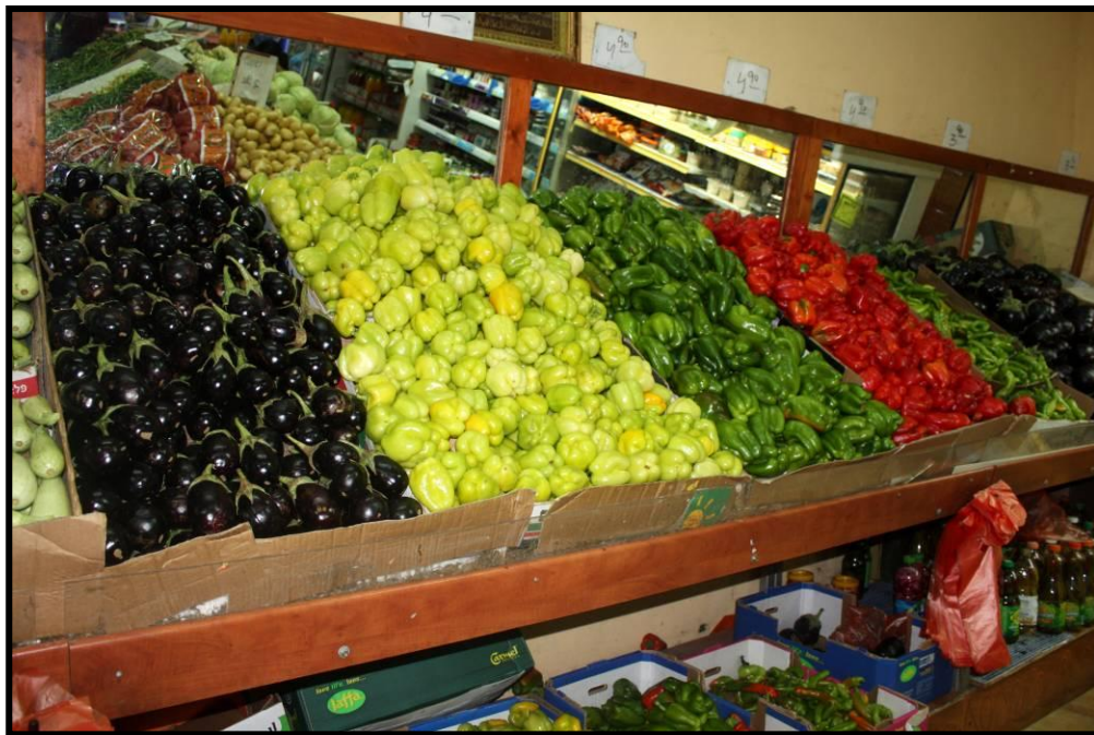
Figure 21: Vegetables in the supermarket in Tamra.