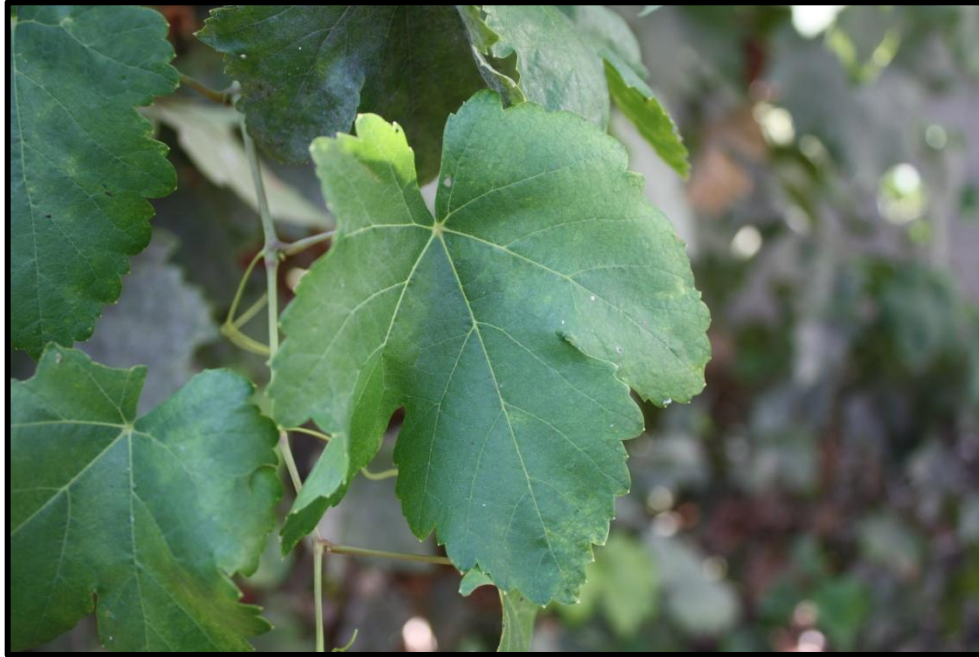
Figure 17: Dawali , grape leaves, eaten stuffed with rice and meat.