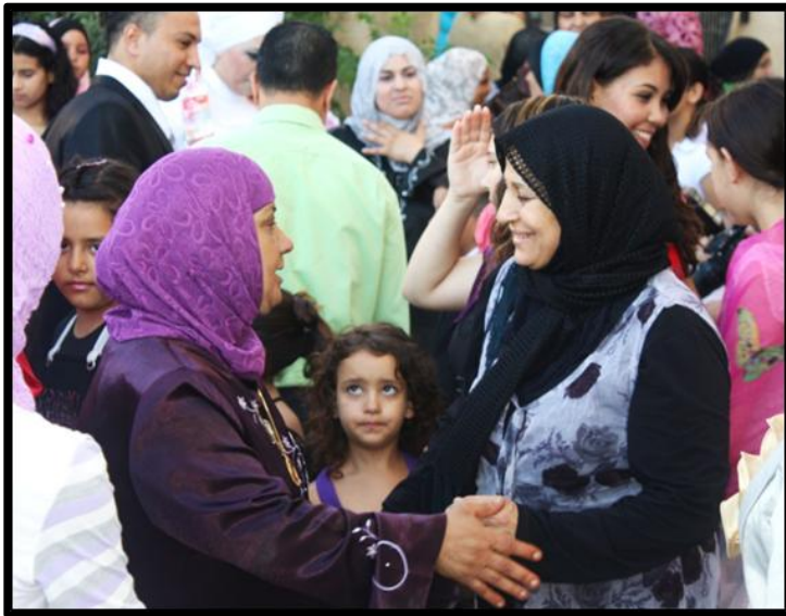
Figure 40: Different styles of dress at the wedding in Tamra.

As mentioned above, standards of dress are different in the city of Haifa than they are in the villages and are also generationally diverse. In Haifa, in her daily dress the mother of my host family wore western style clothing with a headscarf tied in the back, only donning traditional