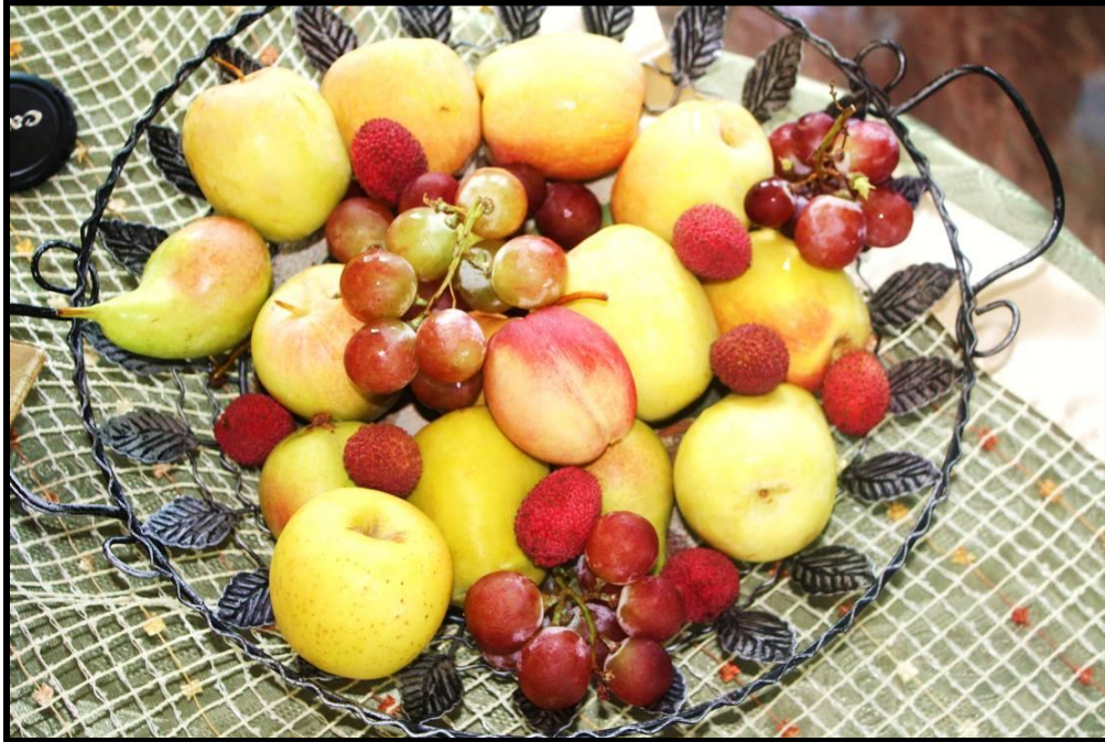
Figure 30: Fruit for wedding guests