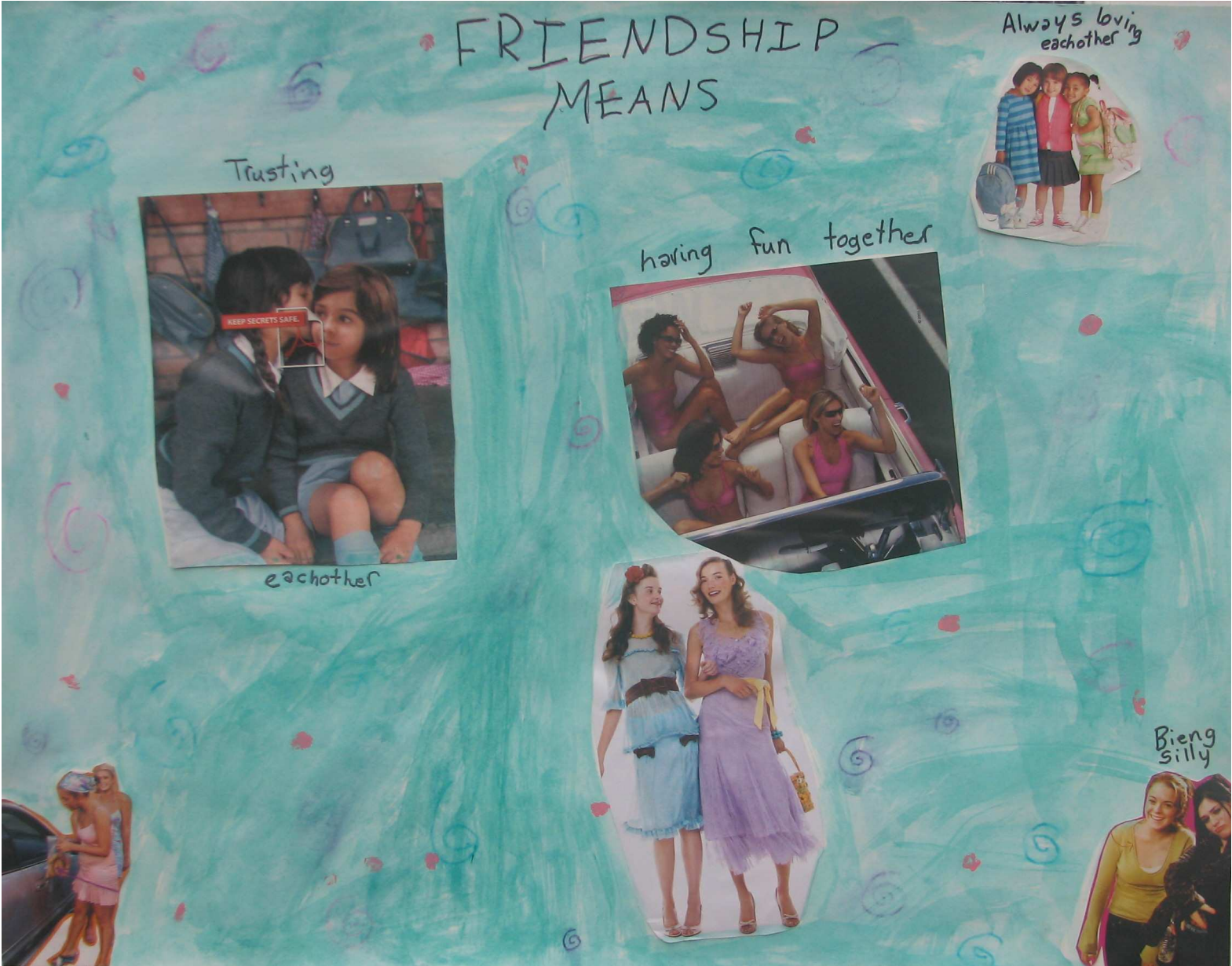
Appendix H - Figure 8.0