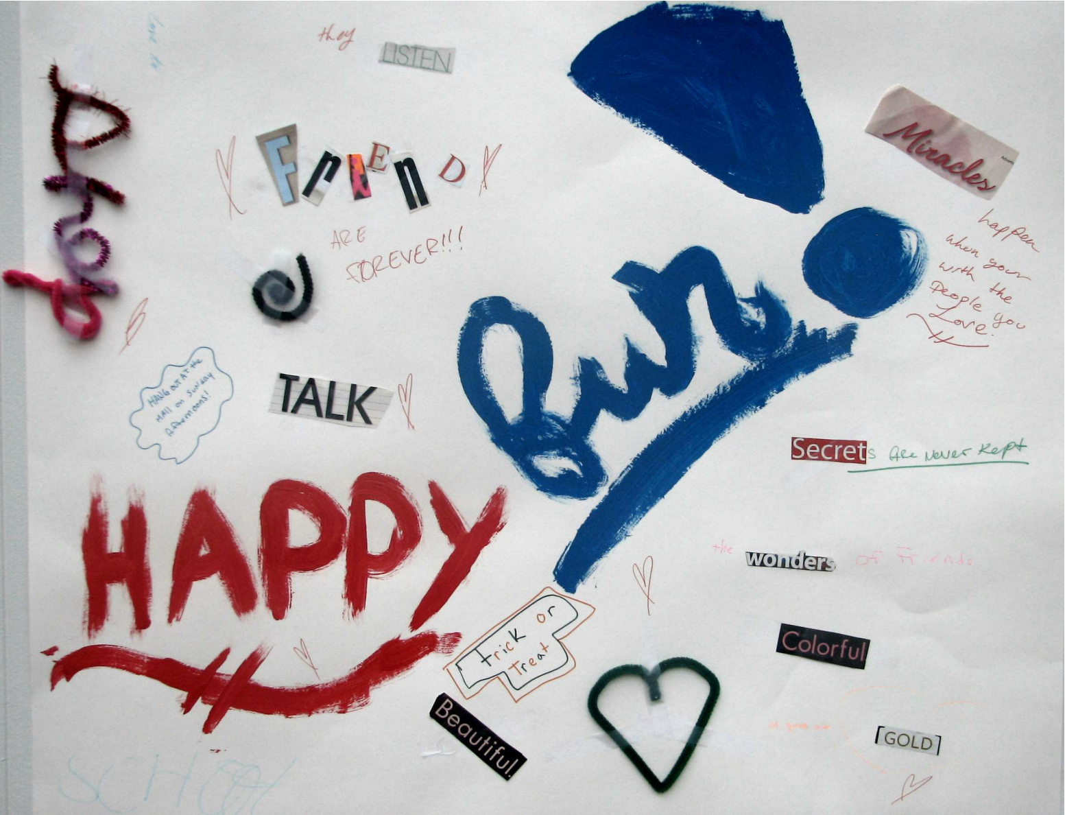
Appendix H - Figure 6.0