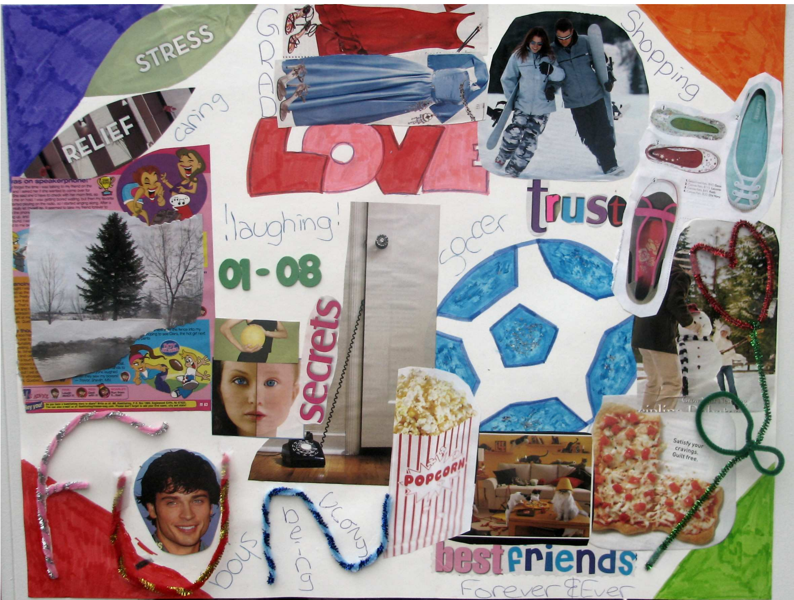
Appendix H - Figure 10.0