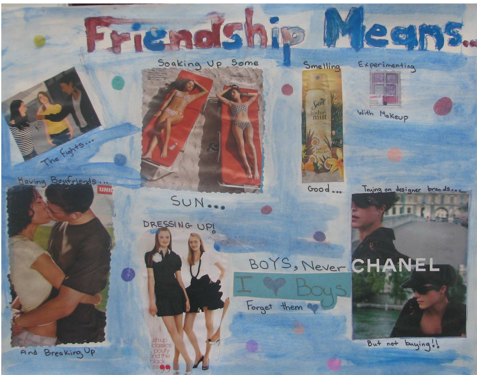
Appendix H - Figure 7.0