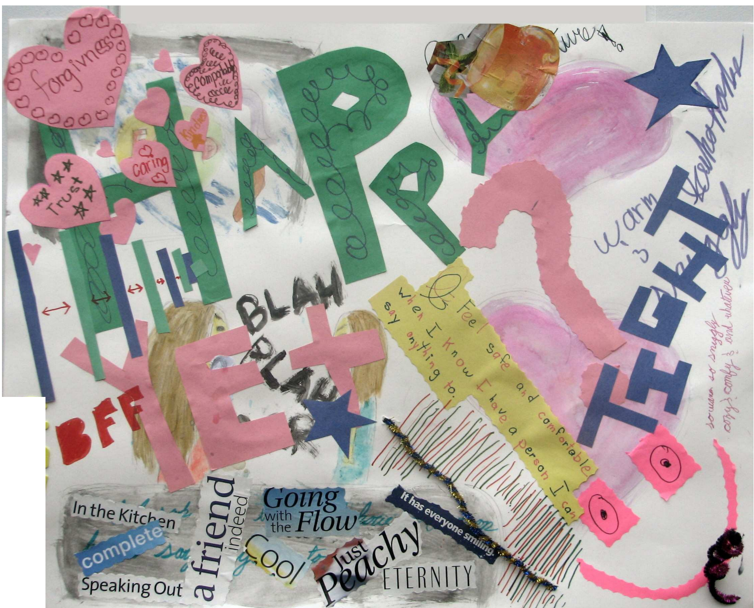
Appendix H - Figure 2.0