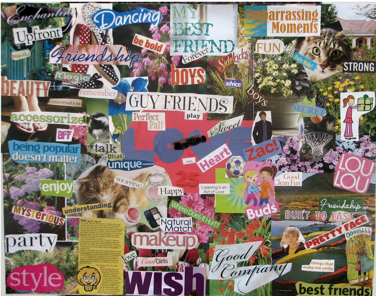
Appendix H - Figure 9.0