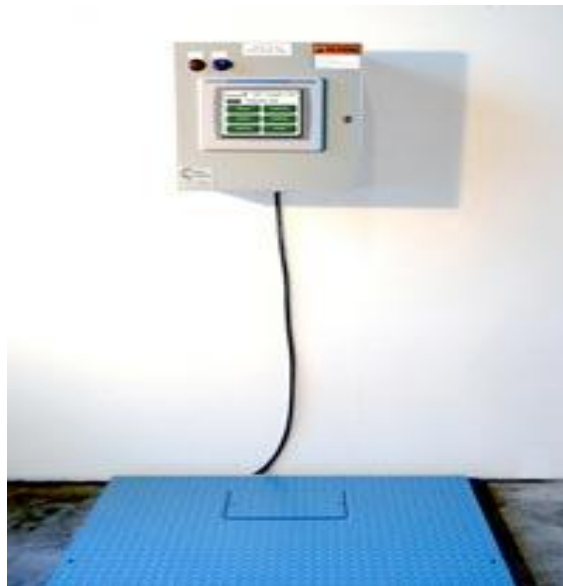
Figure 2 Normandy hardware

Normandy Waste Management Figure 2. system offers a software as well as a hardware for tracking both waste streams and waste trends. It comes with HMI touch screen for ease of use. The management system has a router to connect to regular network, and through the network, it maintains an OpenVPN secure connection to Normandy WMS's network sending real time data to its reporting server.