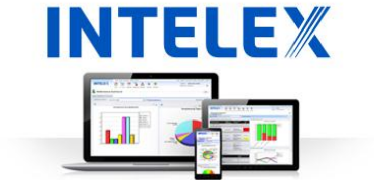
Figure 3. Intelex Software

Intelex Figure.3 is a waste tracking and feedback software that we are able to couple with both our choice of scale as well as a tablet. It has the capability track a large variety of waste management initiatives including: type, month, quantity shipped etc. It is also able to assess real-time data to see the current status of your scheduled activates by date, hauler, manifest or any other metric being tracked.