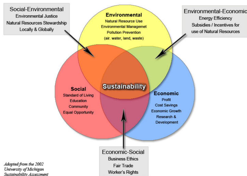
Figure 1. TBL Framework