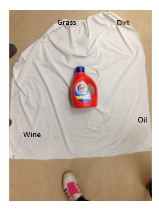
Figure 1: Image on the left shows the sheets prior to washing and the image on the left shows the sheets after being washed with tide cold water (Fryers, 2013).