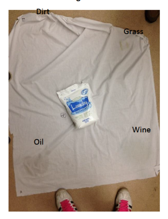
Figure 3: Image on the left shows the sheets prior to washing and the image on the left shows the sheets after being washed with Vancouver Only (Fryers, 2013).