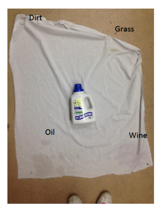
Figure 4: Image on the left shows the sheets prior to washing and the image on the left shows the sheets after being washed with Echoclean (Fryers, 2013).