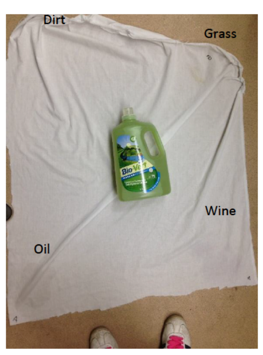
Figure 2: Image on the left shows the sheets prior to washing and the image on the left shows the sheets after being washed with Bio-Vert (Fryers, 2013).