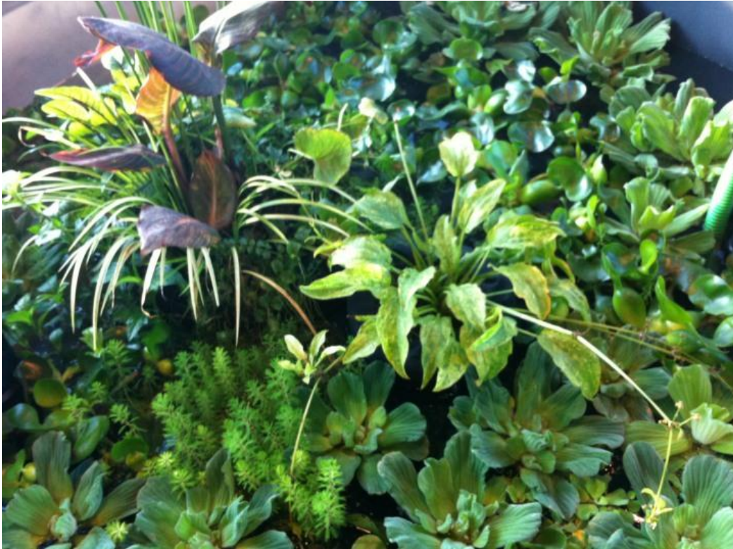
Figure 2: Part of the UBC CIRS Solar Aquatic System.

Almost nothing. The water can be reclaimed to flush toilets and irrigate gardens and is chlorinated.