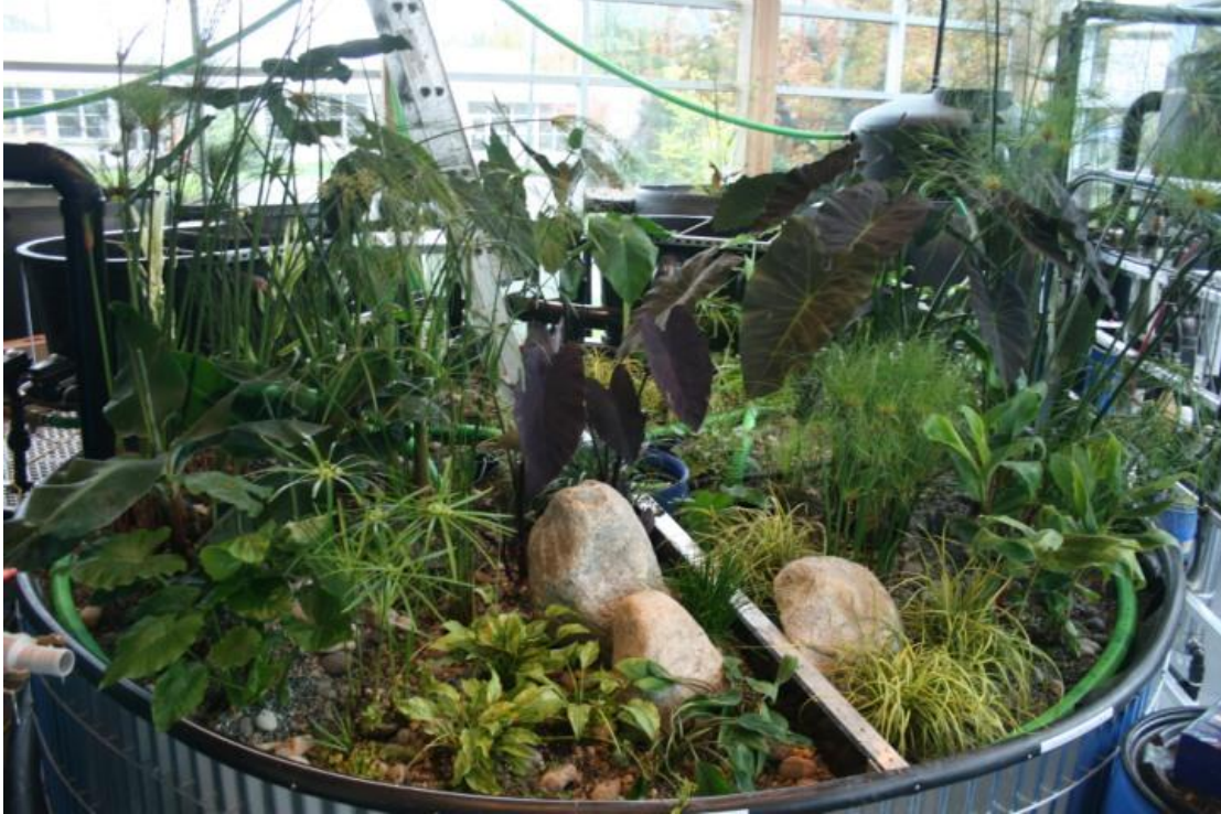
Figure 3: An aeration tank of the Solar Aquatic System.