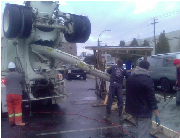
Figure 2: VBC Volunteers pouring concrete for pump construction

The success of a small-scale operation is dependent on public interest and involvement, which explains the increasing emergence of biodiesel Co-ops across North America. Lucas included that the VBC has worked with community groups to enable fleets to become more sustainable in their operation, and has participated in outreach events to increase public awareness on alternative fuels. These social pursuits could be explored by the campus operation as well. Although the UBC operation is not financially dependent on community support, UBC is considered to be a pioneer in sustainability in the public eye. With adequate publicity, the biodiesel operation would help the university secure its reputation as a progressive institution.