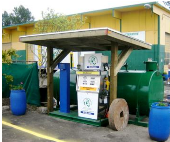
Figure 2: VBC Pump