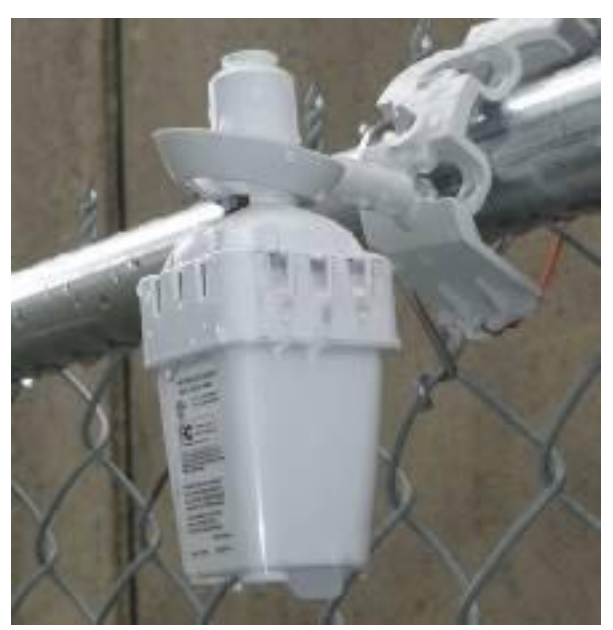
Figure 2: Water sensor currently in use at UBC

The UBC irrigation system is made up of approximately 140 zones. Each zone operates independently of the others. The UBC irrigation system is responsible for watering 453,000 m<sup>3</sup> of lawns and beds. Presently, rain sensors monitor only 167,000 m<sup>3</sup> of this total, approximately 36.9%. The irrigation products supplier, Rain Bird , provides the rain sensors currently being used by UBC. Each rain sensor and its corresponding modular timer can be purchased for approximately $118. The use of a contractor is required for installation. Instillation costs are estimated to be around $400 per unit. The typical life span of a rain sensor is between 15 and 25 years. This report uses a conservative lifespan of 10 years to account for vandalism and other unexpected damages. Figure 2 shows the bucket style rain sensors currently being used in UBC's rain sensored areas.