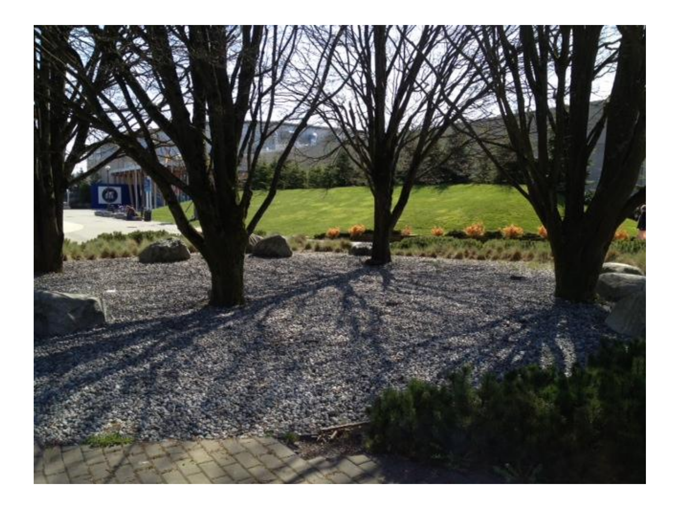
Figure 3: Rock garden at Westbrook Mall and Thunderbird; no irrigation required

In addition to the economical benefits, the installation of rain sensors throughout the UBC irrigation system would have several environmental benefits that would significantly contribute to UBC's sustainability goals. The reduced water usage would decrease UBC's environmental impact by lowering the university's energy demands. The energy associated with pumping water to feed UBC's water supply would be reduced. Additionally, because UBC's irrigation system is fed from the main potable water supply to the university, the environmental impacts of water treatment would decrease. Some of these water treatment