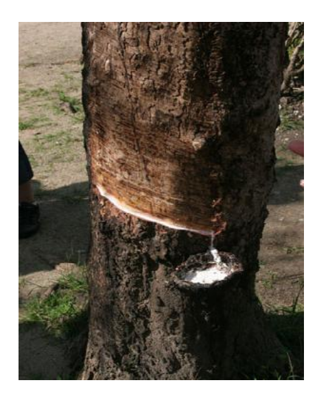
Figure 2 Tapping a rubber tree using angular, semi-spiral incisions.

Thickness of the layer is extremely important because too thick of a slice will damage the tree which reduces its productivity and life. On the other hand, if the slice is too thin, there will not be sufficient latex been produced (Azom.com, 2006). The bark is removed in a localized area for a period of time and then a new area is tapped allowing the tree to repair itself.