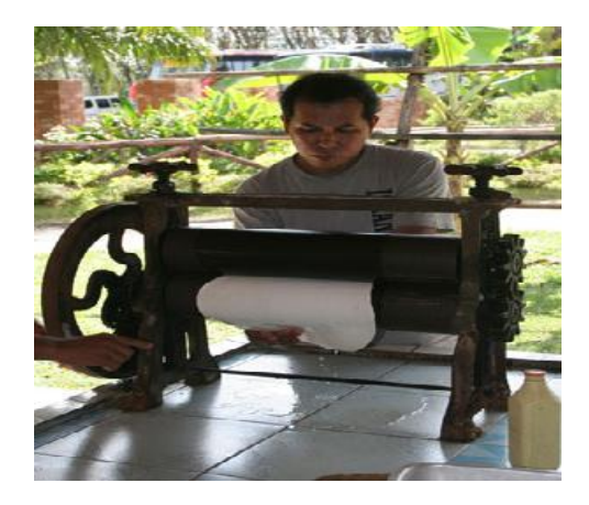
Figure 3 Rolling the latex into thin sheets.

Processing of natural rubber involves the addition of a dilute acid such as formic acid. The coagulated rubber is rolled to remove excess water.