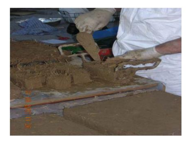
Figure 5 Production of straw bale reinforcement