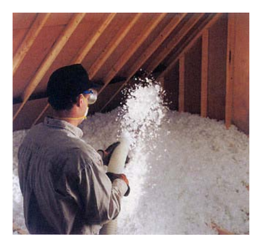
Figure 2 - Blown in Cellulose Insulation (Green Solutions Magazine, 2008)

This type of insulation is a great option for attics and retrofits but can also be used for new structures (Cellulose Insulation vs. Fiberglass). The great part about this form of installations is that there is no need to remove any existing wall fixtures. However, special equipment is needed in order to maximize cellulose's insulating ability, see figure 2. At least two people are required to complete the job and they should preferably be trained professionals. As a bonus, trained professionals can insert cellulose into walls where there is already some fibreglass.