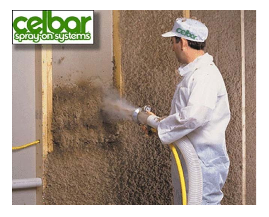
Figure 3 - Sprayed Cellulose Insulation (Celebar International Cellulose, 2010)

The spraying method is very messy though. Windows, doors, and electrical boxes must be protected prior to installation (Fisette, 2005). Also, the fibre that's wasted needs to be cleaned up as the installation process goes along.