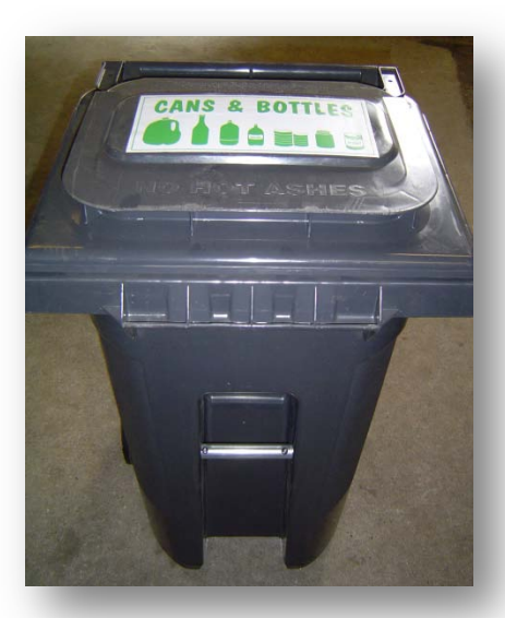
Figure 5. Existing Paper and Can/Bottle Recycling Bins