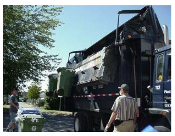
Figure 6. Garbage Truck Owned by the UBC Waste Management Office

Transportation of the collected Styrofoam could be done by the use of a UBC owned truck. UBC Plant Operations Management and UBC Waste Management own trucks that are of the right capacity to haul the collected Styrofoam to the recycling plant.