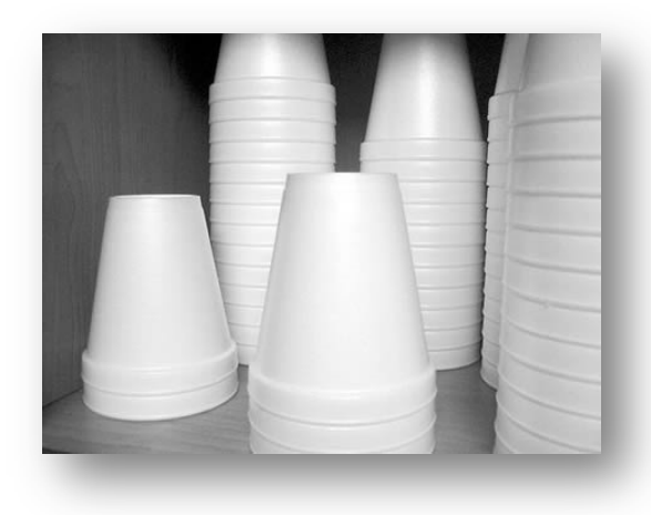
Figure 1. Styrofoam Cups.