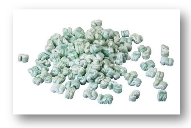
Figure 3. Packing Peanuts.

Packing peanuts are usually S-shaped and are found in packaging of delicate items for protection. They are light and inexpensive.