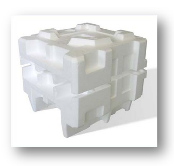
Figure 2. Packing Block.

In its lightness, Styrofoam is used to protect items during transit; it acts like a "cushion." At UBC, items that are shipped and received need Styrofoam packing blocks to prevent damage.