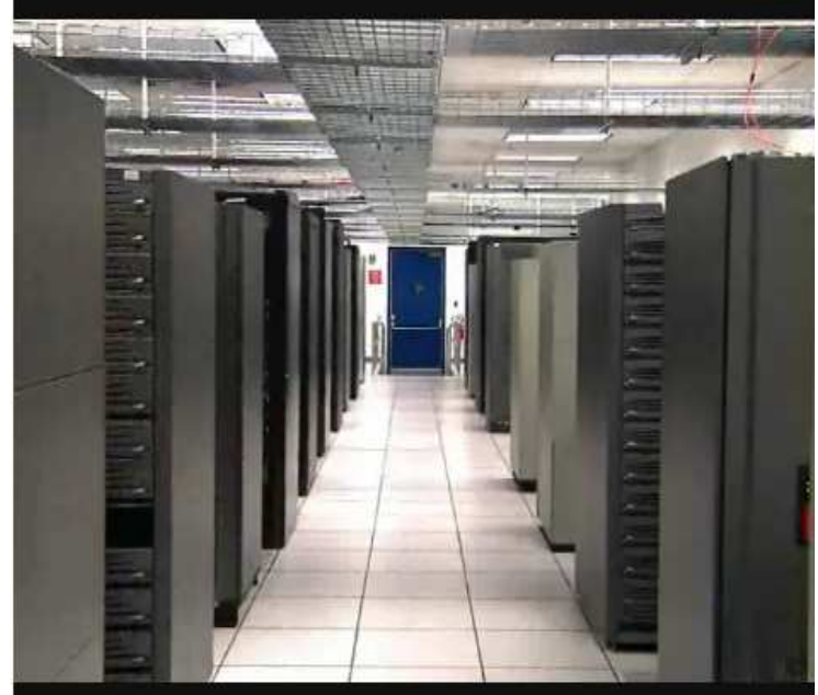
Figure A1 Inside view of Iron Mountain Inc. storage facility Reference : Iron Mountain Inc. Website Video Tour www.ironmountain.ca/en/services/tours/